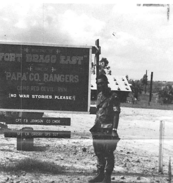
, Jr., spent 1970-71 with P/75th. y the Command Sergeant Major of ommunications-Electronics Command Ft. Monmouth, NJ.