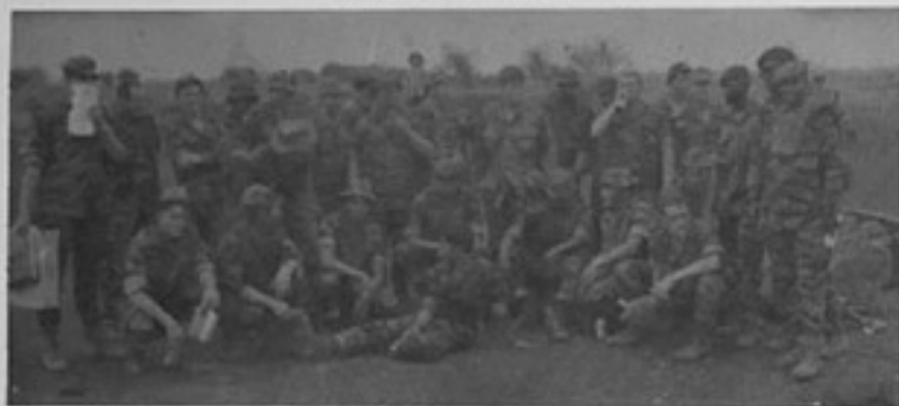
3RD PLATOON, E/20TH INF (LRP) APR 1968 GUY ON THE LEFT MUST BE CIA!