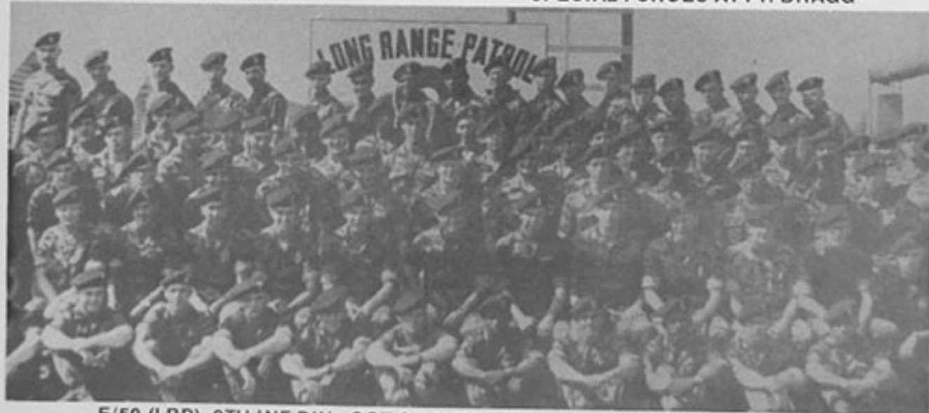
E/50 (LRP), 9TH INF DIV. OCT OR NOV 1967.