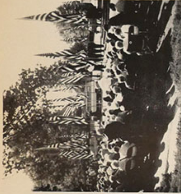
WWII RANGER BN. MEMORIAL SERVICE AT THE NATIONAL CEMETARY FT SMITH, AR