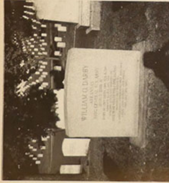
FOUNDER OF MODERN RANGERS, GEN. WILLIAM O. DARBY'S GRAVE AT THE NATIONAL CEMETARY FT SMITH, AR