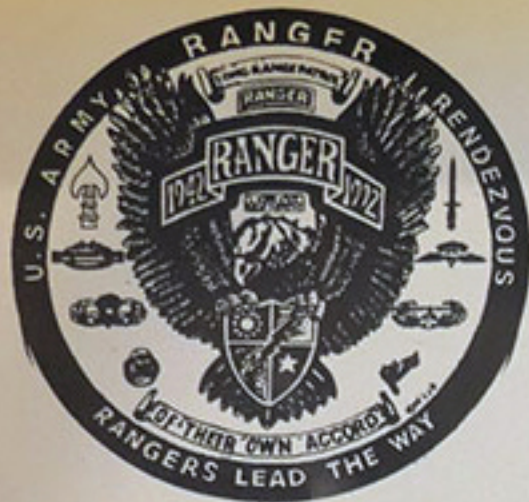
FRONT OF COIN DESIGNED BY DUKE DUSHANE. 3 INCHES IN DIAMETER