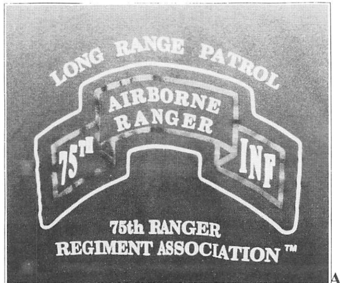
ASSOCIATION LOGO T-SHIRT