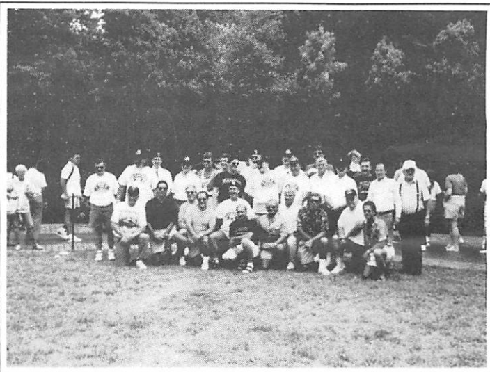
9TH DIV LRRP'S. E/50TH LRP AND E/75TH REUNION