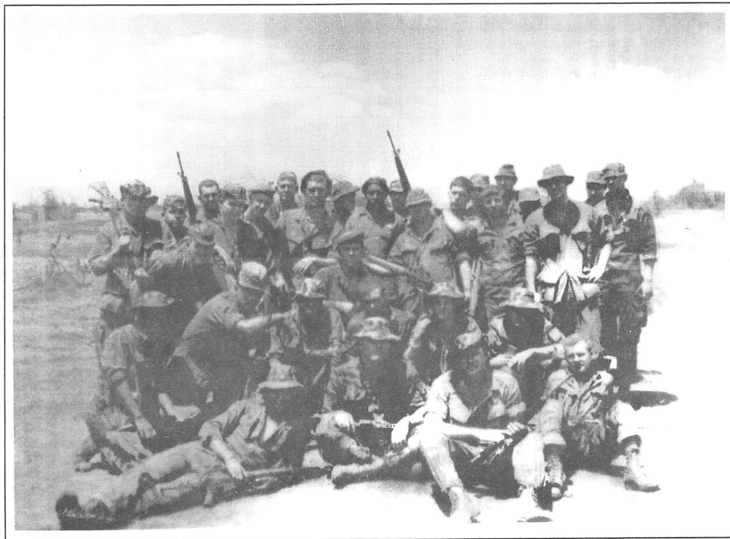
1ST PLATOON, COMPANY E, 20TH INF (LRP) AROUND JUNE 1968